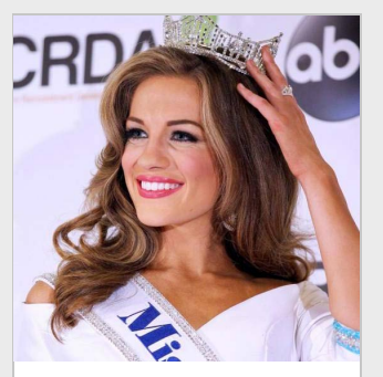
New Miss America is Greek | Neos Kosmos