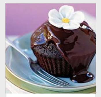
Chocolate cupcakes with olive oil | Neos Kosmos