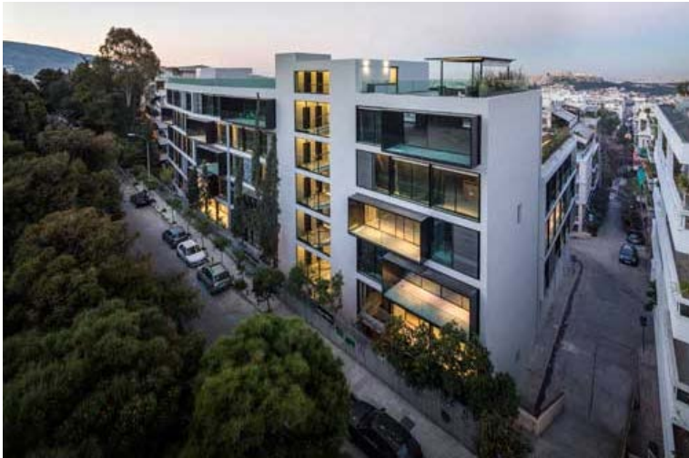
Sitting on the foot of Lycabettus Hill, the iconic building designed by pioneer architect and town-planner Constantinos A. Doxiadis adapts to its surroundings. Recent additions by the Divercity team are not out of proportion or character.